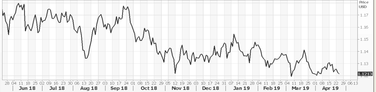
Daily Euro / US Dollar

The US House of Representatives requested 6 years of Trump's (business and personal) tax returns. US Treasury Secretary Steven Mnuchin missed the deadline (2100 GMT) to submit Trump's tax returns which could result in a potential court battle. The next round of US-China trade talks is anticipated next week (commencing 30 April). China celebrated its 70th year of founding its navy by revealing its guided missile destroyers. The sanctions waiver on Iran fuelled supply concerns, with Iran exporting an estimated 900,000 barrels per day. Iran's largest oil buyers are India and China. Today, Germany's business surveys are anticipated for April. Gold was softer and reached a high of USD1277.25 (ask) an ounce.