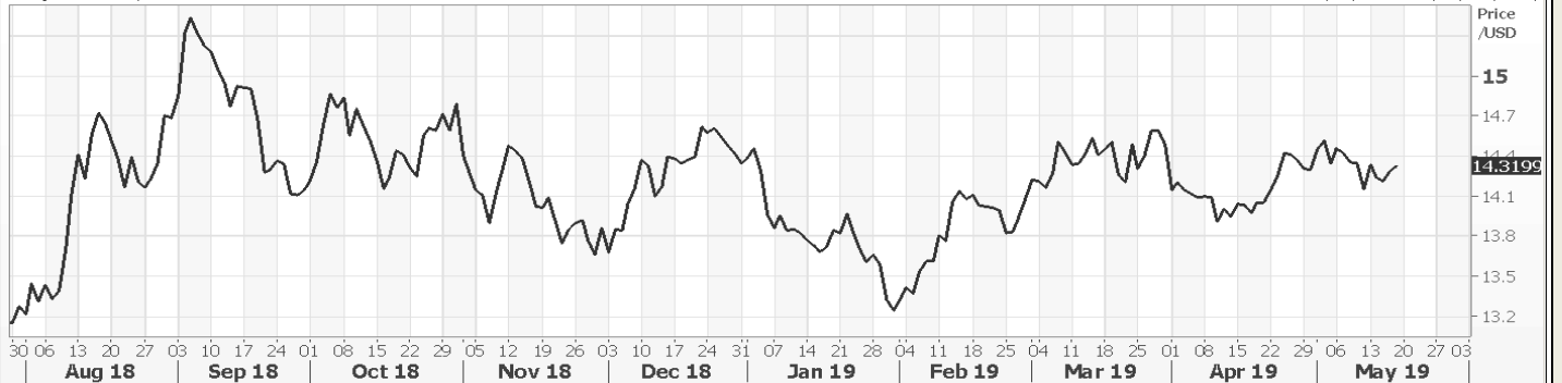
Daily US Dollar / SA Rand